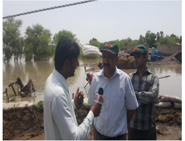
Snaps during assessment at flood affected areas district Khairpur: